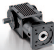
Planetary bevel gear boxes