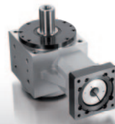
Hypoid gear boxes