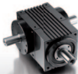
Bevel gear boxes