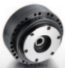
Cycloidal gear boxes